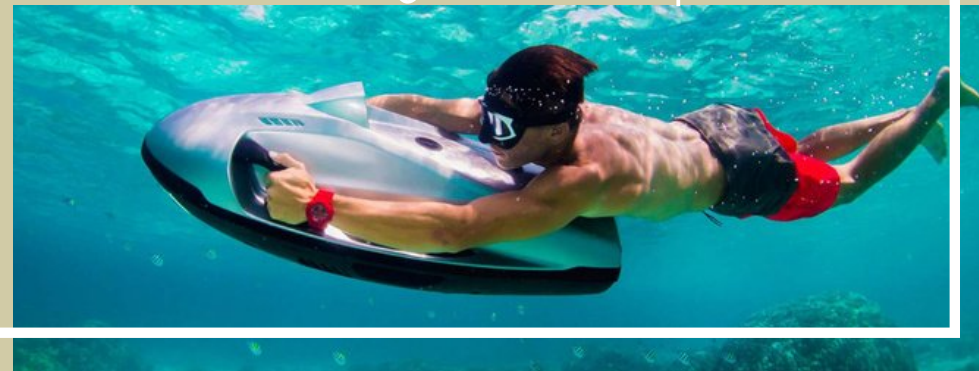
iAQUA - on request