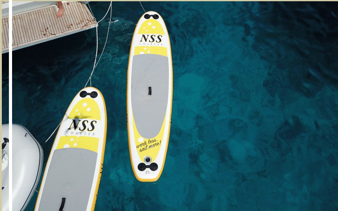
STAND UP PADDLE